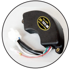
New AVR Regulation for Full Load Smooth Power Output