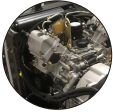
Kompak Diesel Engine V Twin, Vertical, 4-Stroke, Water-Cooled