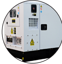
Soundproof and Rainproof Canopy Compact Design