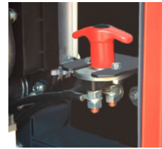
Battery Isolator Switch