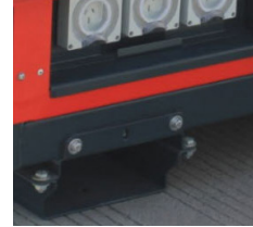
Heavy Duty Forklift Pockets