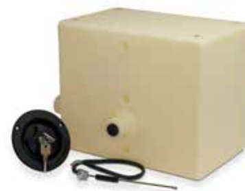
15 litre plastic tank

E&OE - Specifications are subject to change without notice. - 151029